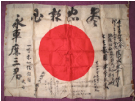
Soldier's name: Mr. Renzo Eisha. Returned to his daughter in Tokyo prefecture.

OBON 2015 is pleased to announce another five flags were returned during the month of January / February. Each flag is like a pebble tossed in a lake, with ripples spreading out in all directions.