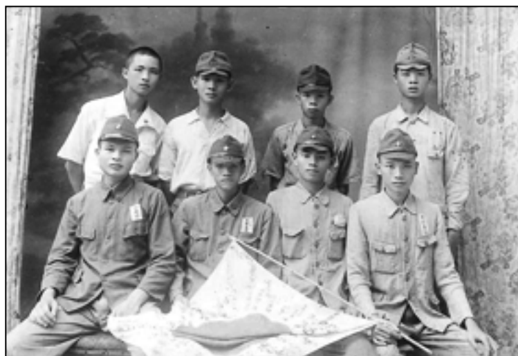
Taiwanese soldiers with Yosegaki Hinomaru